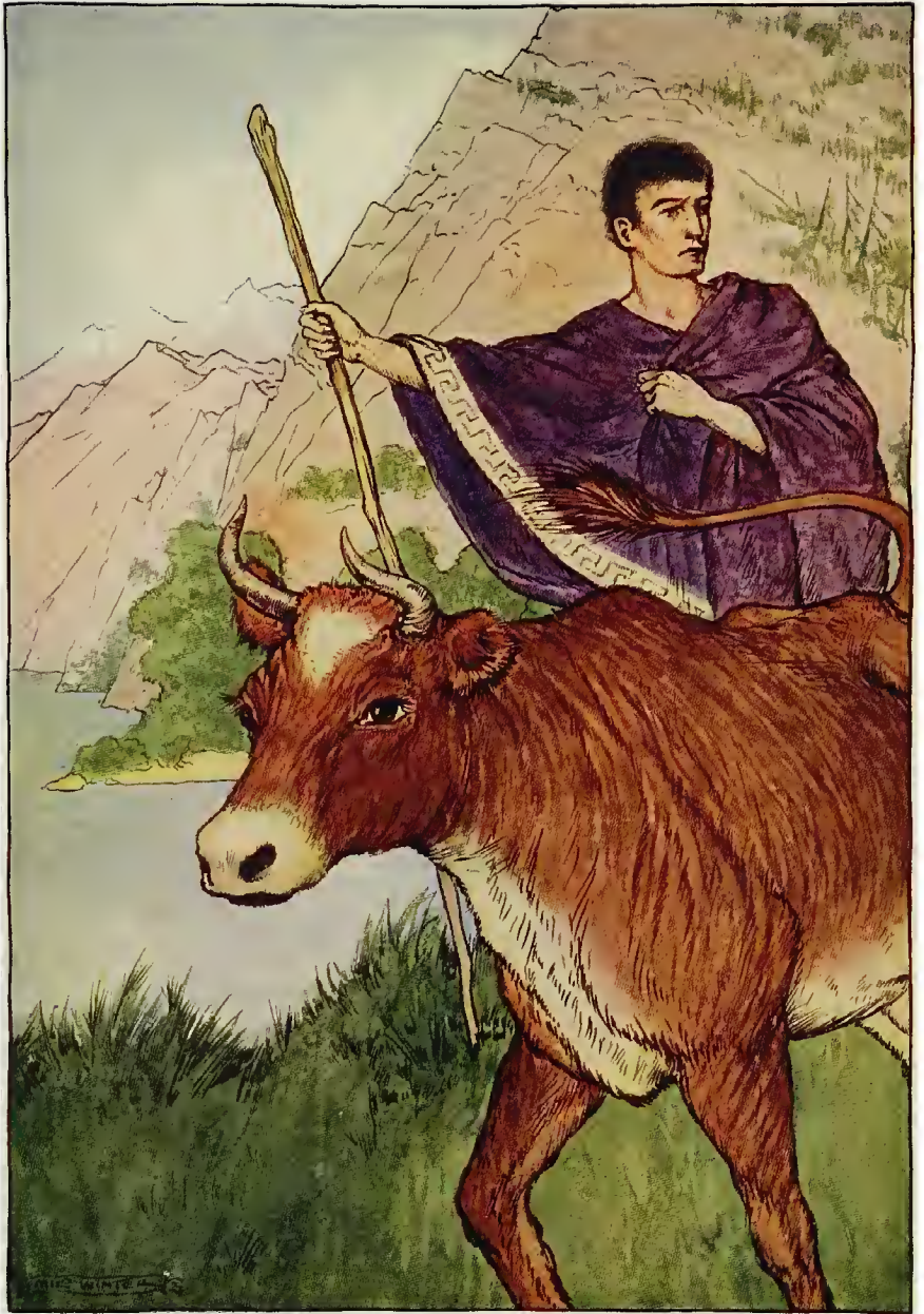
The brindled cow never offered to lie down